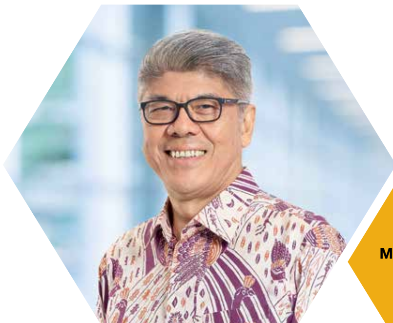
MULIADI RAHARDJA Commissioner